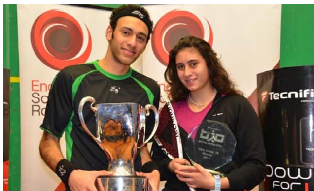
El Shorbagy and El Sherbini won the British Under 19 Open titles.

Egypt's Mohamed Abouelghar retained third place and Indian Mahesh Mangaonkar dropped to four - while Richie Fallows, runner-up to fellow countryman Holland both in the French and German Opens, rose 12 places to No5.